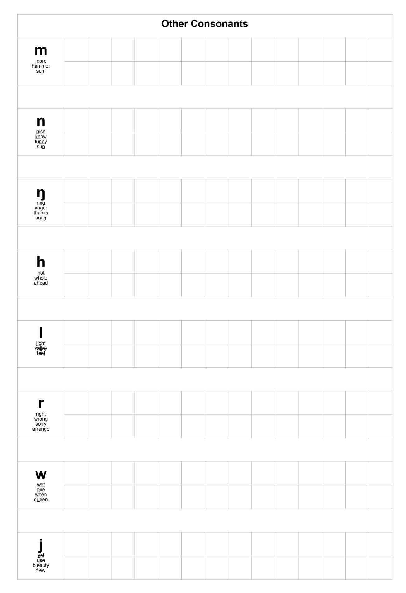
IPA For English - Writing Practice